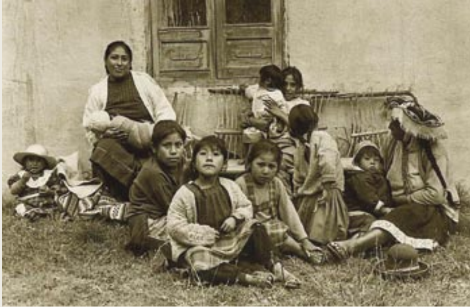
“Salk’a Folk” (Salka means “undomesticated energy” in Quechua.)